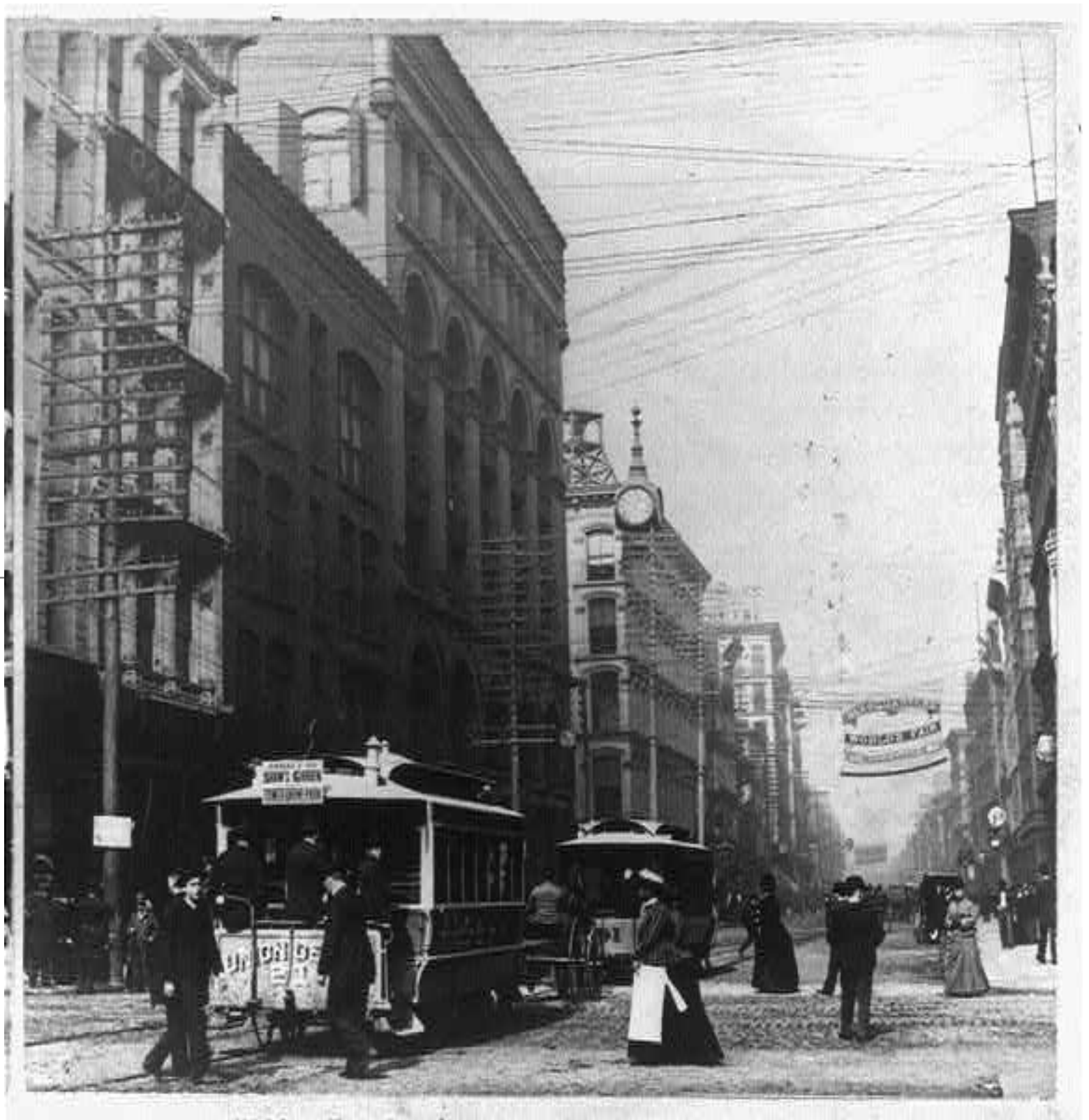
5390. In the Streets of St. Louis, Mo. U. S. A.