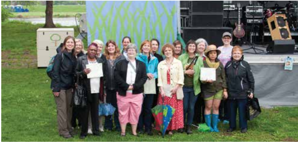
Community groups were awarded a total of $10,000 in Earth Day Action Grants at Earth Day Eve.

The 9 community groups and organizations at right represent our third class of Earth Day Action Grant recipients. A total of $10,000 was awarded to support grassroots initiatives that share the mission and vision of Earth Day. Recipients were recognized at the Earth Day Eve party on the Saturday evening prior to the Festival.