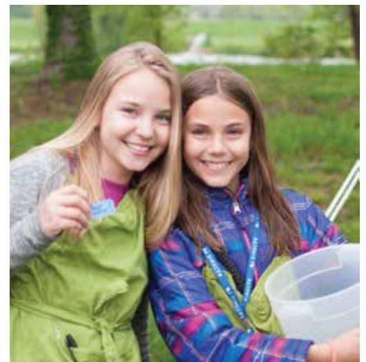
Volunteers assisted with the fundraising efforts at Earth Day Eve this year.