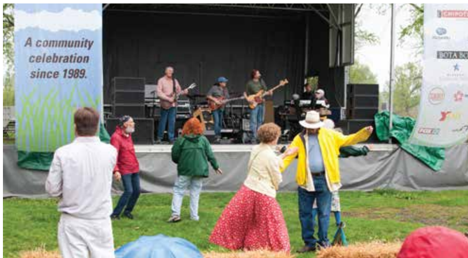
"Earth Day Eve was wonderful and a great way to start the celebration of Earth Day." - First-time attendee.

For a third year, we hosted Earth Day Eve the Saturday night before the Festival 4 pm to 7 pm in the beautiful new location of the Earth Day Cafe. This event offered an opportunity for St. Louis Earth Day supporters and Festival participants to mix and mingle as they listened to Grateful Dead cover band, Jake's Leg, perform on the Cafe Stage. Tickets to a special "Friends of St. Louis Earth Day" tent featuring a buffet and free beverages, SOLD OUT this year! Many took the opportunity to tie-dye limited-edition St. Louis Earth Day T-shirts, and bid on some fabulous items in the silent auction.